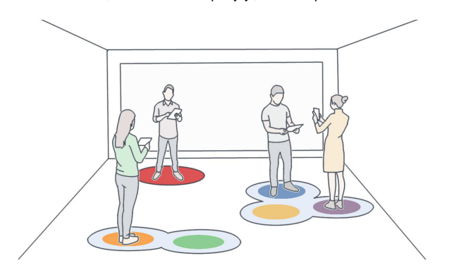
Figure 1: Eery Space

Copyright is held by the author/owner(s). This paper was published in the Proceedings of the Workshop on Collaboration Meets Interactive Surfaces (CMIS): Walls, Tables, Mobiles, and Wearables at the ACM International Conference on Interactive Tabletops and Surfaces (ITS), November, 2015. Madeira, Portugal.